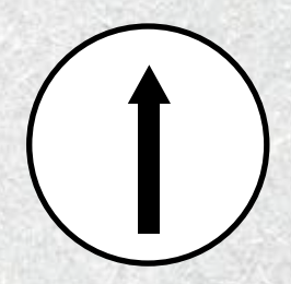
SUPPORT SALES & INVESTMENT