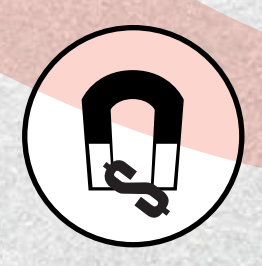
ATTRACT KEY VENDORS